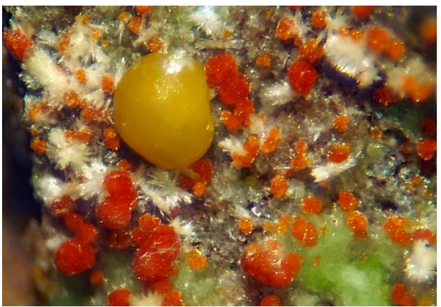
Calcurmolite ball with Umohoite, and white Uranophane (?), scope stack 6 images. FOV 1.5 mm.

Photos taken with Mitutoyo lens and bellows: