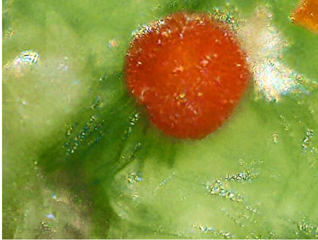
In the next article, we will return to manganese minerals, but this Umohoite specimen was a delightful summertime diversion.