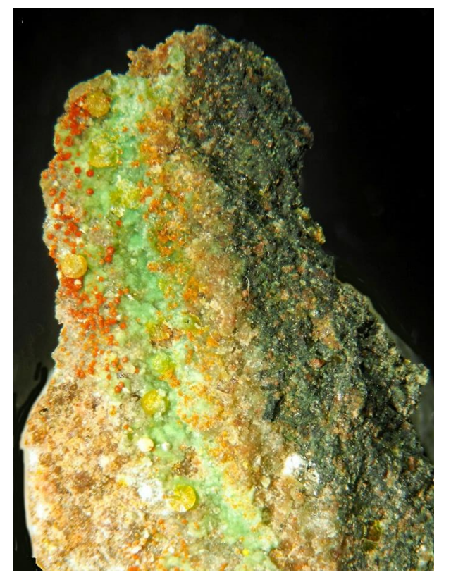
Umohoite & Calcurmolite, Scope stacking 9 images. FOV 10 mm. ("The Dinosaur"?)