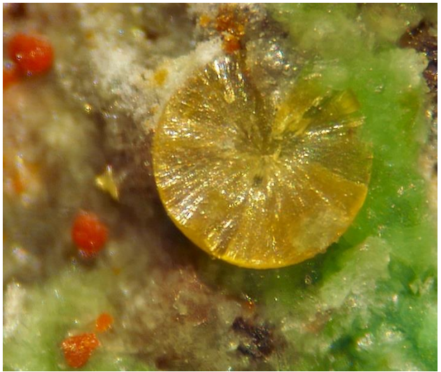
Calcurmolite wheel, scope stack 2 images. FOV 1 mm.