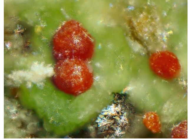
Umohoite on green Zeunerite , Mitutoyo stacking 19 images. FOV 0.5 mm. Green plates of Zeunerite below and left of red Umohoite ball, capped with white Uranophane. Mitutoyo single image. FOV 0.25 mm.