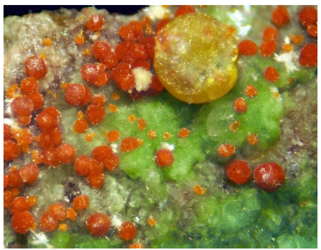
Umohoite & Calcurmolite, scope stack 4 images. FOV 2 mm.