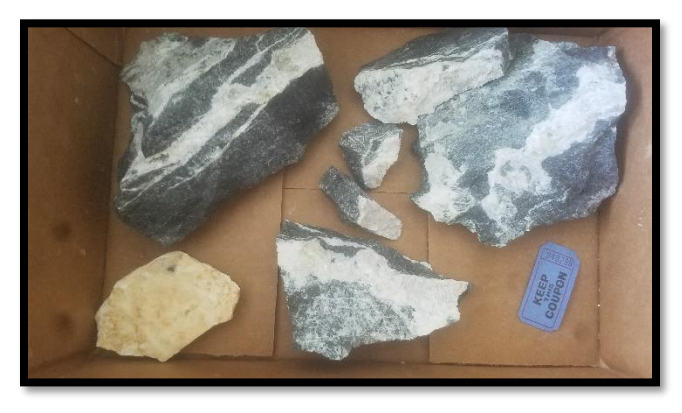
Brucite with white magnesite

Our May 11th field trip to the Penn-MD serpentine quarry in Lancaster County, PA took us to the new, and deepest level of the quarry which presented us with a lot more brucite than I had seen on three previous collecting trips. Most of the brucite was clear to white micaceous thin layers...occasionally large pieces a half meter wide but only 1 cm thick. I found a boulder with pockets of white magnesite crystals and took some home. Under the scope there were greenish-yellow, hexagonal brucite crystals, 1-3 mm. Both the brucite and the magnesite gave fluorescent SW & LW response as shown in the attached photos. I will try to get us back into this quarry in October or November.