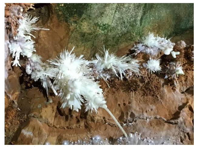
Anthodites on the ceiling in Skyline Caverns. FOV about 1 meter.

On the way home, we stopped at Skyline Caverns near Front Royal, where, by good luck, the cave management had temporarily removed the anti-idiot protective screens from the cave formations to permit photographs for a new brochure. Here is a photo of the cave formations called "Anthodites".