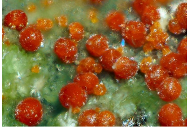
Umohoite, Mitutoyo stacking 9 images. FOV 0.7mm.

Photos taken with Mitutoyo lens and bellows: